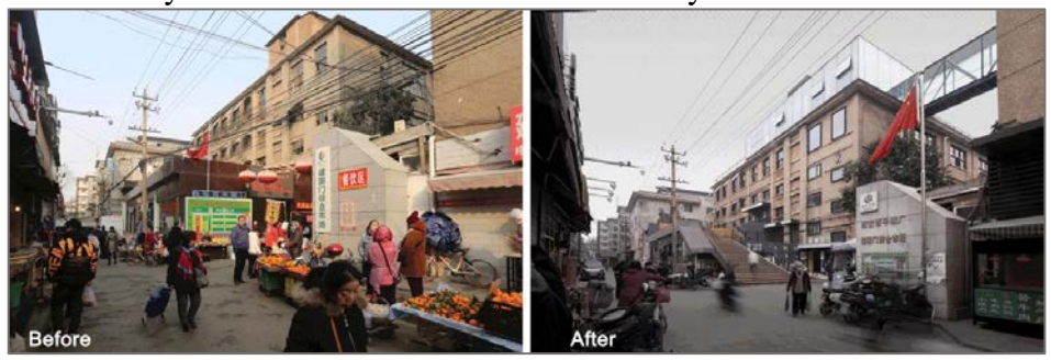
Figure 3. Comparison before and after regeneration (Source: [27])

In 2004, due to the government's goal of widening roads, the Jianguomen market was faced with a demolition crisis. Xi'an Velvet Factory used the original vacant land and factory buildings to transform nearly 50 business rooms and several sales desks. The first floor of the original office building was transformed into a business area, adding garment area and catering area outside the original production building. After this transformation, the market expanded to 5,000 square meters, which can meet the living needs of nearly 100,000 residents in the surrounding area, and also solved re-employment and pension problems for many laid-off workers of the velvet factory.