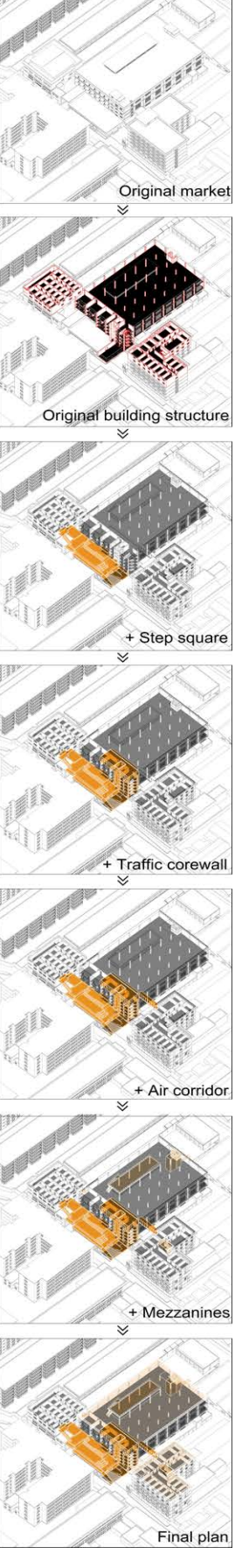
Figure 4. Plan generation

of Xinyi lane is a row of traditional stores, after the regeneration, each store has a small logo designed by the Old Market operating members hanging on the top, which is both unified and distinctive.